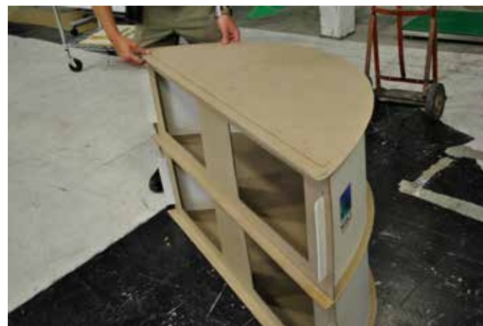
5. Place "2" shelf on second module with label facing up.