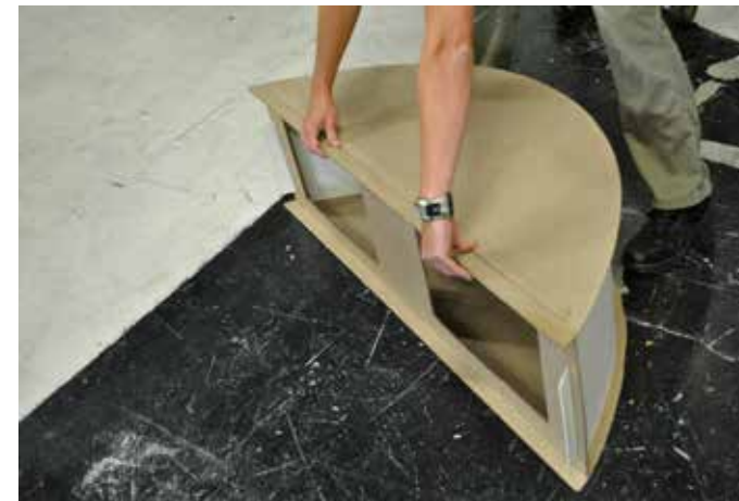
3. Place "1" shelf on first module with label facing up.