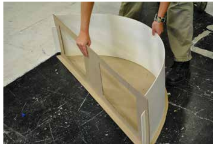
2. Place first module on top of "floor" shelf, aligning with channel.