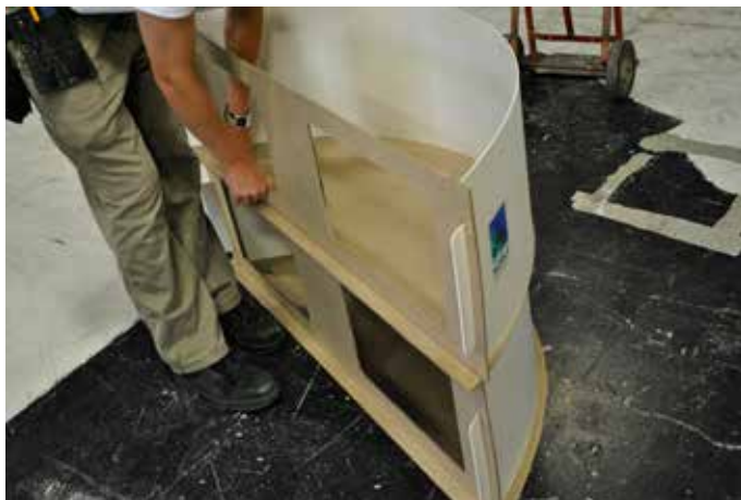
4. Place second module on top of "1" shelf, aligning with channel.