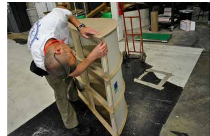
5. Place desktop shelf (2ply) on second module, aligning channel.