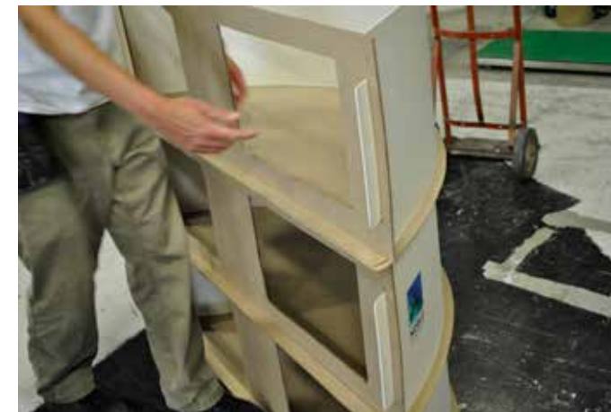
6. Place third module on top of "2" shelf, aligning with channel.