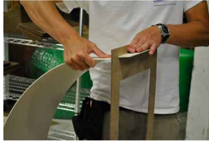
2. Insert second tab into slot by curving FlatCOR™.