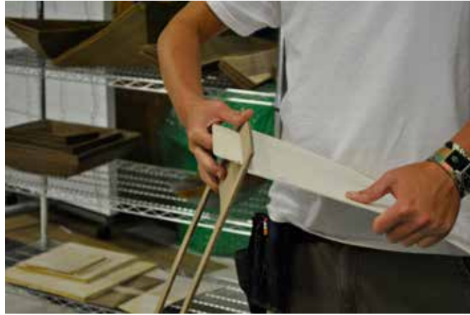
1. Insert first tab into slot.